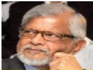
Shri Arun Gandhi (Grandson of Mahatma Gandhi)

The international webinar was Inaugurated by Hon'ble Shri Bhupesh Baghel, Chief Minister, Chattisgarh on 08 th August 2020.